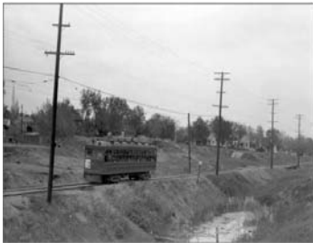
The interurban trolley running just west of Federal