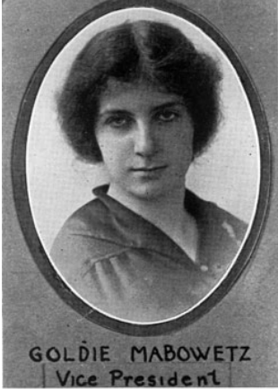
Prime Minister Golda Meir