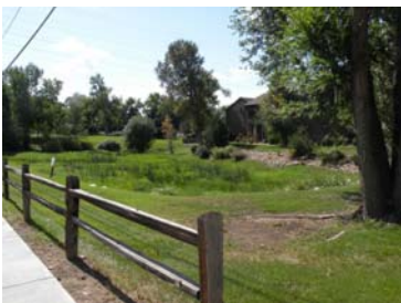
Original "Lake" in Lakewood. Dry Gulch at 10 th Avenue & Pierce