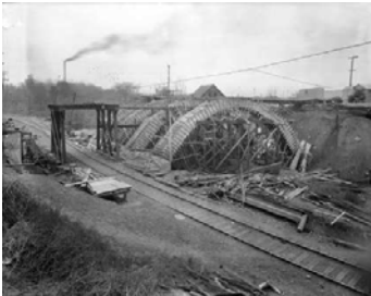
Construction of the Federal Bridge - 1922