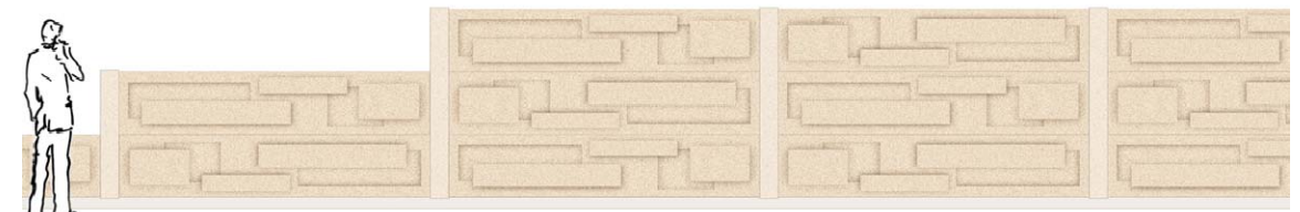
NOISE BARRIER AT STATION WITH CRAFTSMANS THEME PATTERN