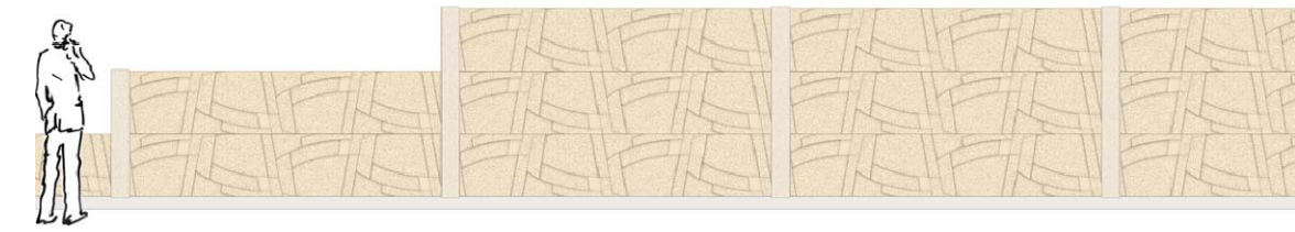
NOISE BARRIER AT STATION WITH INTERURBAN THEME PATTERN