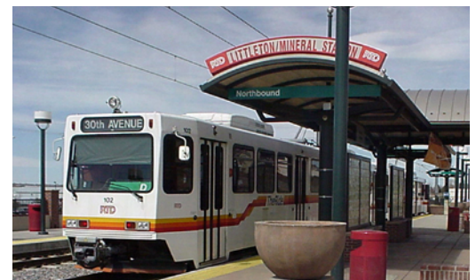
Existing Southwest Corridor Light Rail Station at Littleton/Mineral