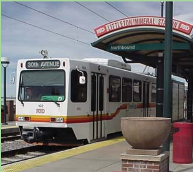
Existing Southwest Corridor Light Rail Station at Littleton/Mineral

The EE process will include a community involvement process, evaluation of alternatives (including a summary of prior studies), selection of a preferred alternative, and identification of potential impacts and recommendations to minimize and mitigate those impacts. The RTD Board of Directors will use the EE to approve the selection of the preferred alternative and commit to mitigation measures.