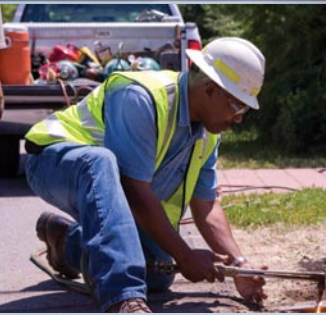
Workers begin construction on the West Corridor.