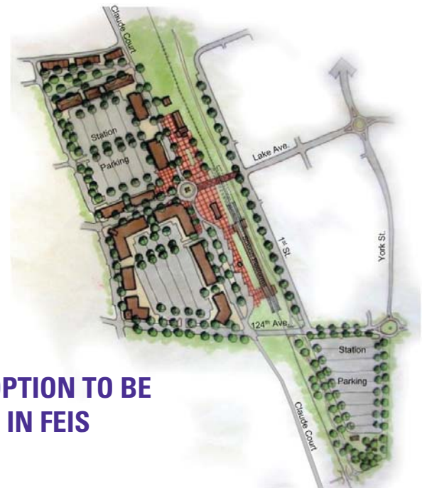
124 TH AVENUE EASTLAKE TOD PLANNING

EASTLAKE TOD OPTION TO BE EVALUATED IN FEIS