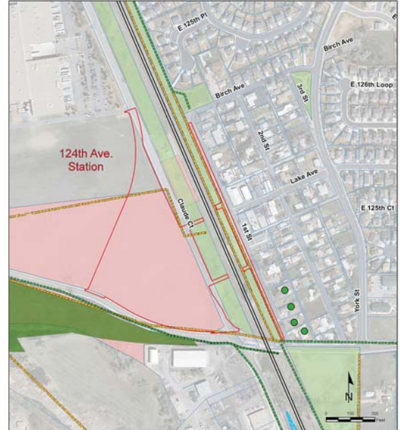
124 TH AVENUE STATION – IMPACT ILLUSTRATION

RTD recommends evaluating the 124 th Avenue Station option and the 124 th Eastlake TOD option in the FEIS. RTD will undertake additional consultation on concepts for refining the station with the City of Thornton, key stakeholders, and the community.