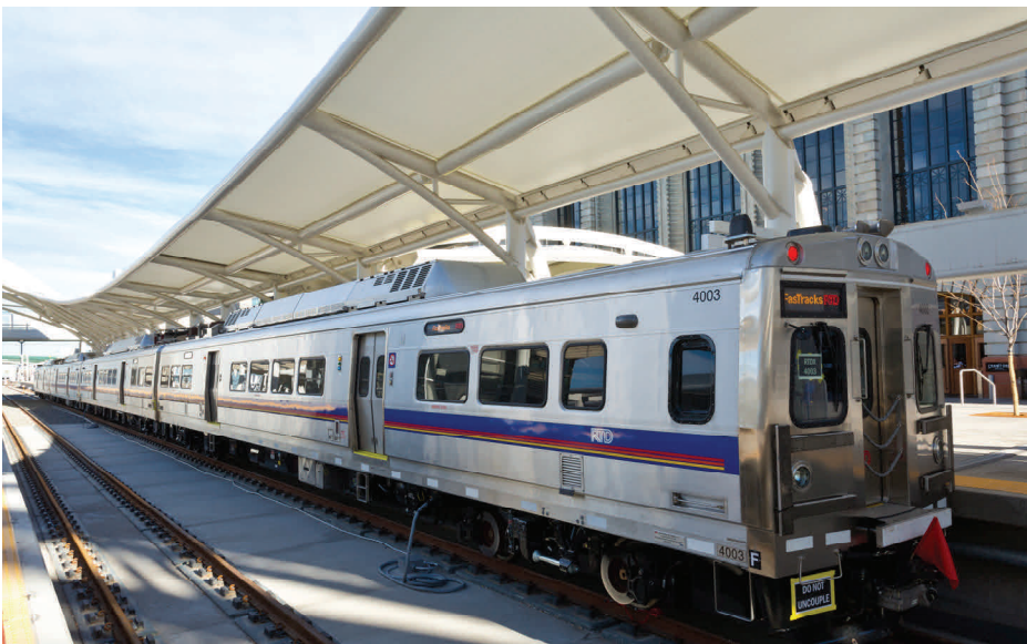
The RTD commuter rail vehicle, which will be used on the East Rail Line, Gold Line, Northwest Rail Line to Westminster and the North Metro Rail Line.