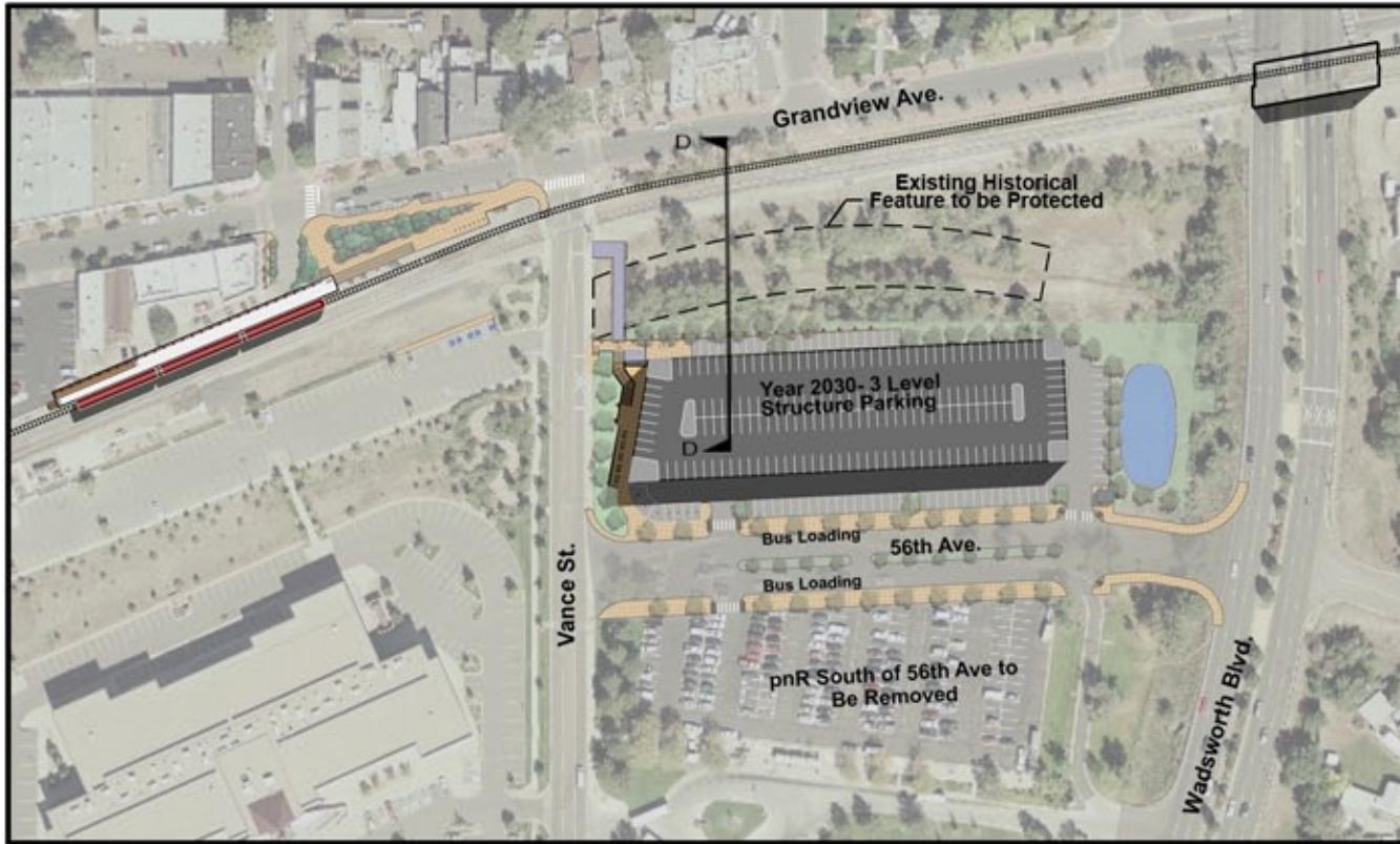
Site Plan (2030)