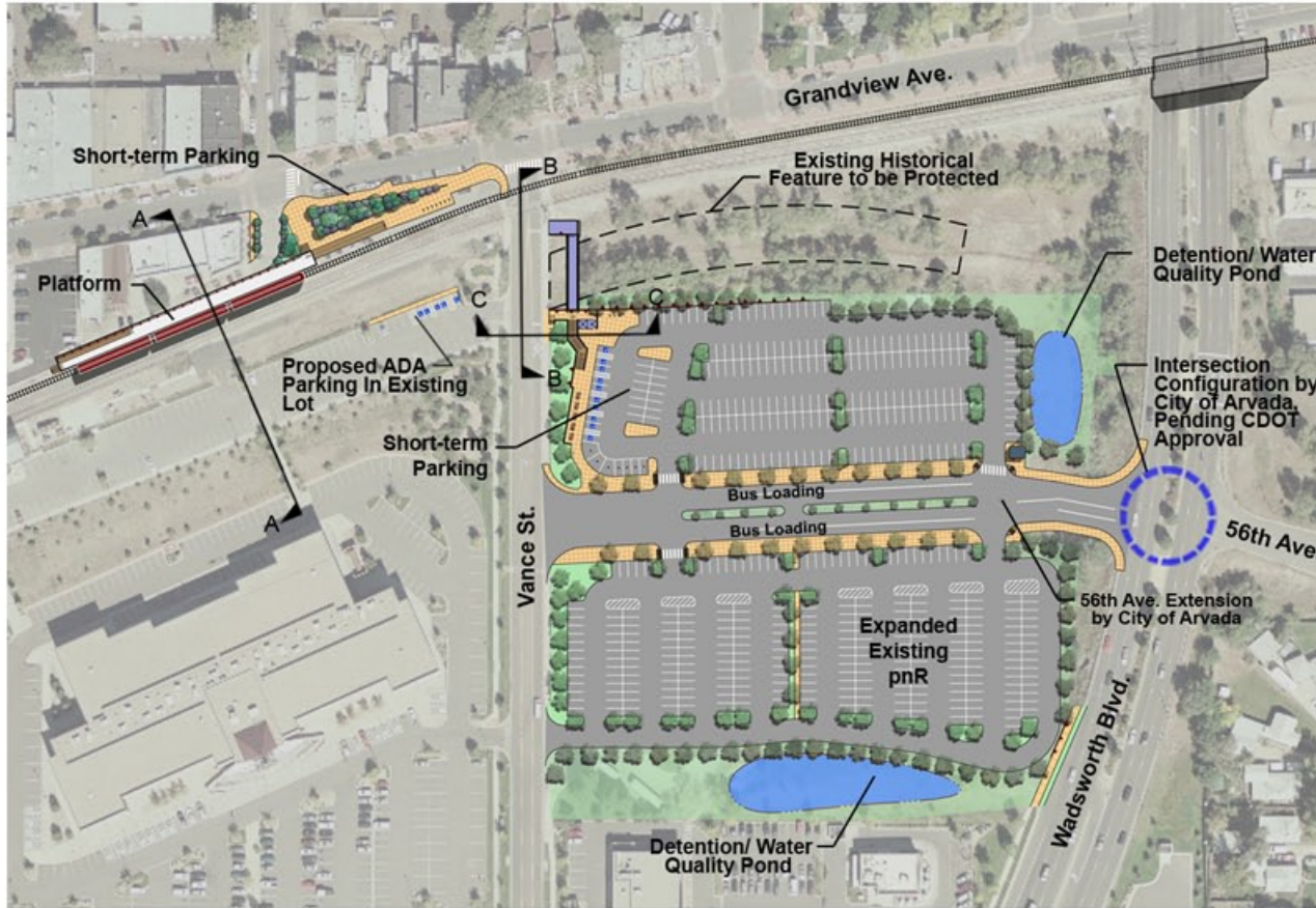
Site Plan (Opening Day)